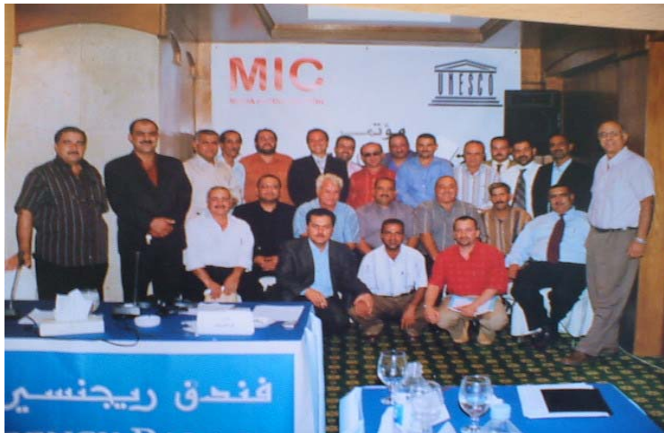
MIC and UNESCO conference with 22 Iraqi Radio station Directors, 9 August 2005.

Prior the radio reports production, on 15 August 2005 a conference was held for which representatives and directors of 22 Iraqi radio stations were invited to Amman. The purpose of the conference was to network with Iraqi radio stations to find ways of future cooperation, in general, but specifically to agree on the distribution of ready-to-broadcast radio reports evolving around the topic of the new constitution.