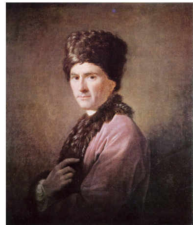
“... that the fruits belong to all and that the earth belongs to no one”

We will never come to terms with the “empire of shame” ( Jean Ziegler ), not with hunger in the world, oppression, racism and prejudice, not with disappointed ideals and easy answers, not with the inexorable logic of the path of least resistance. The march of one generation through and into the institutions is by far not enough for us. We