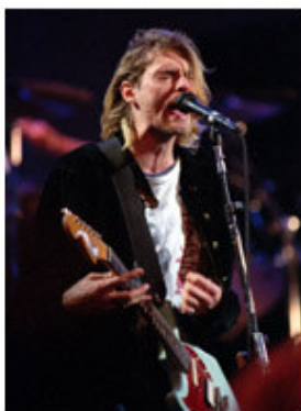
“Generation X” Photo: Curt Kobain, Nirvana

We are no longer the Generation X that calls out to the party and business leaders: „Here we are now, entertain us“ ( Nirvana ). We’ve seen the Ärzte and are still in favour of visions.* But the eternally unredeemed promise of full employment is no longer on offer.