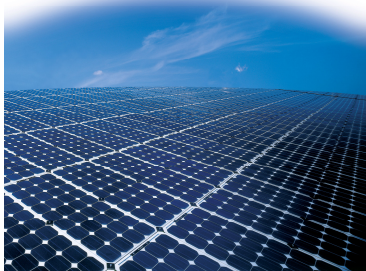
“100 percent renewable energy”

We don’t believe that talent is inborn, because every person has potentials. What we want, therefore, is a revolution of our education system . No more learning factories and fees, no more selection according to background, no more fast-track studies and fast-track Abitur! Let’s invest our wealth in the potentials of the people, in their education and development, in what we have in common and our culture, no longer in luxury mansions and luxury trips, no longer in luxury cars, no longer in all the private ersatz trappings.