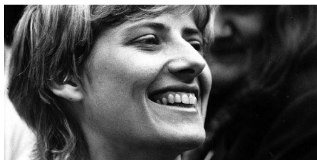
“The future must be able to count on the Greens”

If not us, then who? A new time needs new actors, a new sensorium, a new language, a new political