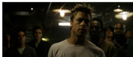
“Working jobs we hate...” Photo: Brad Pitt in Fight Club

What we have to offer is freedom and solidarity. No, solidary individualism is not a contradiction, we are convinced that there can be a society “where the free development of each is the condition for the free development of all” ( Karl Marx, 1848 ). And that is why we still call a war a war and still consider poverty and marginalisation a scandal; that is why we are by conviction emancipatory and on the left , which is the same for us.