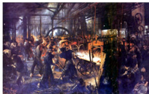
“Rules and rhythms of industrial society”

– for both genders – the possibility of free choice . We no longer believe that the rules and rhythms of the family, the old school, the barracks and the factory are the models for our life, love and work, we step out into the open field and out of industrial society. No one should have to earn a life of human dignity in the market place, a new social foundation therefore requires a new guarantee .