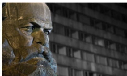
“The free development of each, the free development of all”